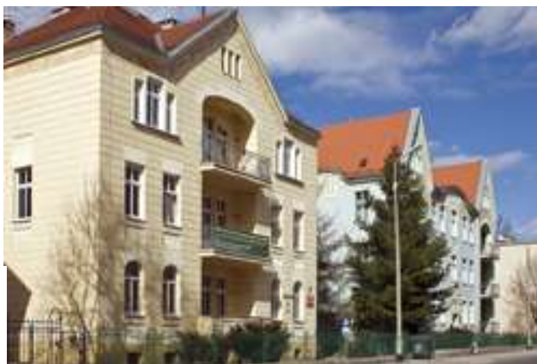
Collegium Neophilologicum of the University of Applied Sciences in Nysa – the building of the Institute of Modern Languages and the Section of Business English

The specialised and translation vocational practice can be pursued in all kinds of business entities maintaining international commercial contacts – small and medium-size enterprises, commercial law companies, production and service plants, travel agencies, foreign companies and other foreign trade-related institutions as well in local administration/government institutions and translation offices. In the first phase of the vocational practice, students become familiarised with the functioning of a company. They deal with the tasks in which they can make use of their command of English, e.g. making telephone calls, collecting information from the press, the Internet and other mass media, writing official documents and offers. In the further part of vocational practice, students make use of their skills obtained within translation courses by translating and interpreting consecutively and, if possible, simultaneously.