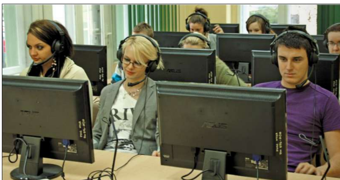
Students of Business English in language laboratory, where English phonetics and English-Polish and Polish-English interpreting are taught.